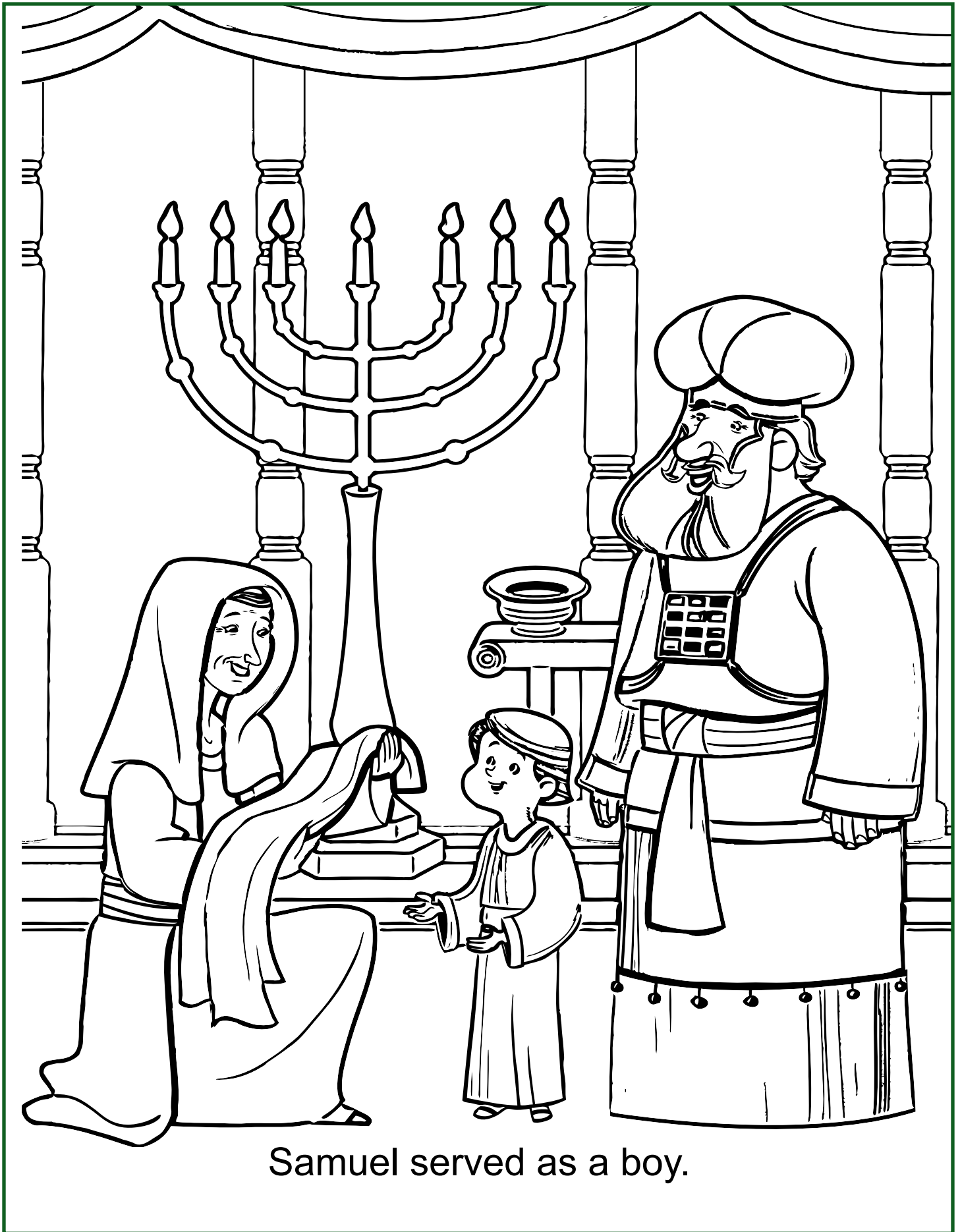
Samuel served as a boy.